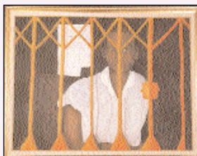
Locked out of school donated by Yolene Legrand, 18"x24", oil on canvas